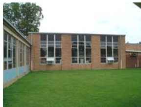
Former Cafeteria Exterior / Hallway Window Wall