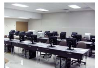
New Media Center (Former Library)