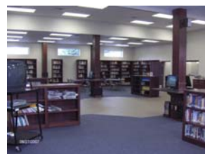
New Library (Former Cafeteria)