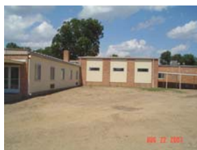
New Library Exterior / Hallway Exterior